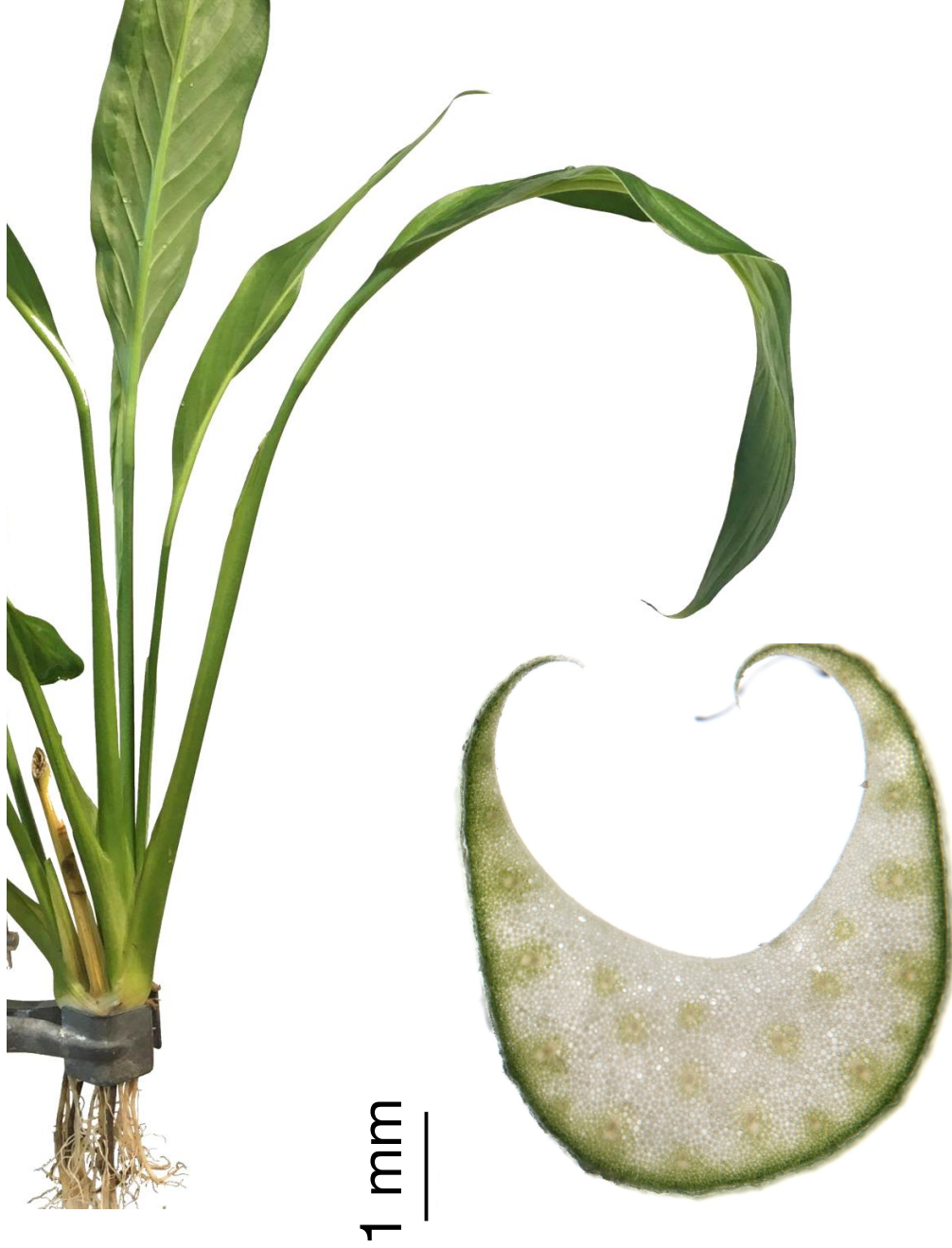
Spathiphyllum Cross section