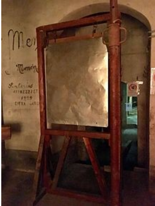
Plaque-tonnerre au Teatro della Pergola de Florence