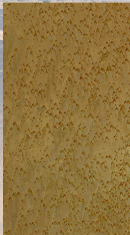
FIGURE: Barchan field.